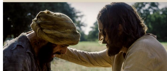
"Churches are not museums that display perfect people. They are hospitals where the wounded, hurt, injured and broken find healing." - Nicky Gumbel

Please bring a packed lunch. Tea and coffee will be provided